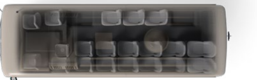
19+1 Seater (2-doors)