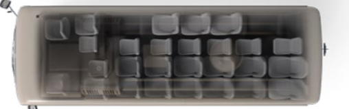
26+1 Seater (2-doors)